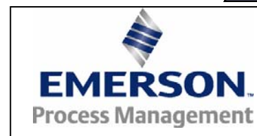
Acquired By Emerson Named Power Industry Center of Excellence for Emerson