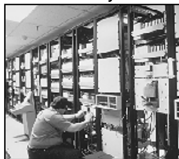
Westinghouse P250, P2000, W2500 & 7300 Systems