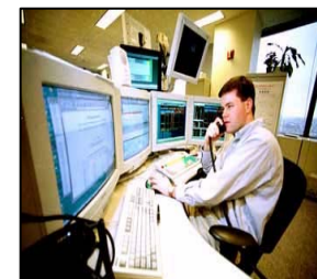
Ovation Fleet Management Edition Ovation Foundation Fieldbus