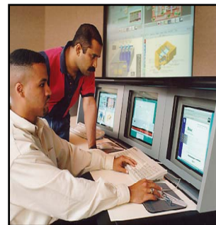
Ovation Control and Information System