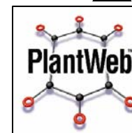
Ovation PlantWeb with AMS Inside