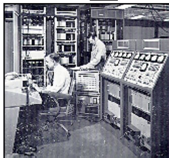
Westinghouse P50 -- First Mini-computer