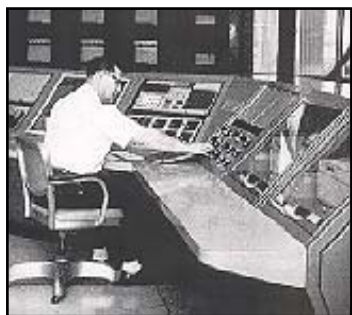
Westinghouse PRODAC -- First Digital Computer Control