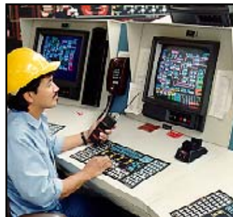
WDPF Distributed Control & Information System